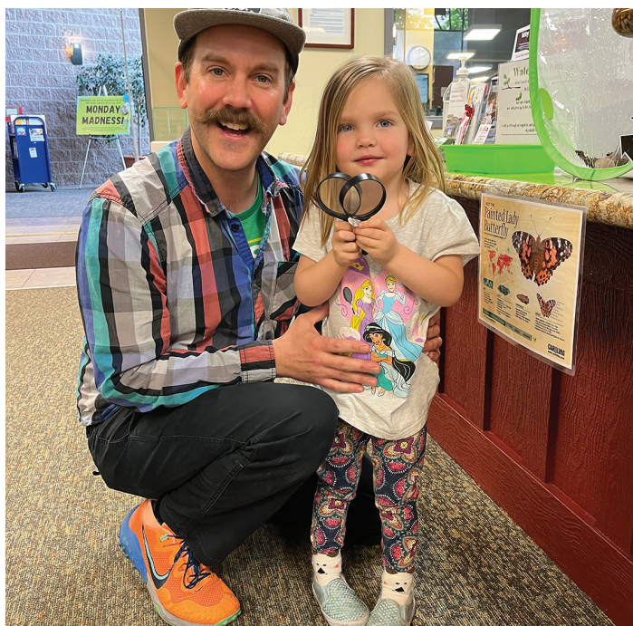
Before storytime, a little patron and her dad celebrate a butterfly emerging from its chrysalis.