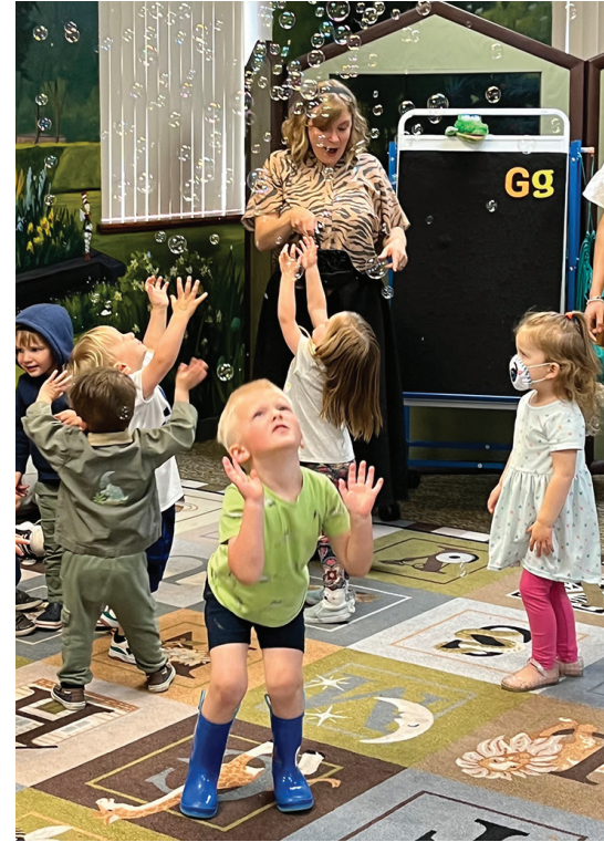
Bubbles, bubbles everywhere!

It's a good thing that the Garden City Library is known as "Not a Quiet Library" because very little people can produce a very big ruckus, especially when the bubbles start flying during Toddler Tales! Each week about 15-20 toddlers and their parents gather to hear stories, sing, dance, and meet new friends, activities that are so fun that the children don't even realize that they're absorbing valuable pre-reading and social skills the whole time. With the help of Alex the Alphabet Alligator, staff members focus on one letter sound each week, and at least one of the stories they read to the children highlights that sound, as in "G" in Good Night, Gorilla by Peggy Rathmann. Between stories the toddlers "dance"—wave their arms and hop around—to a silly song about glue and later learn