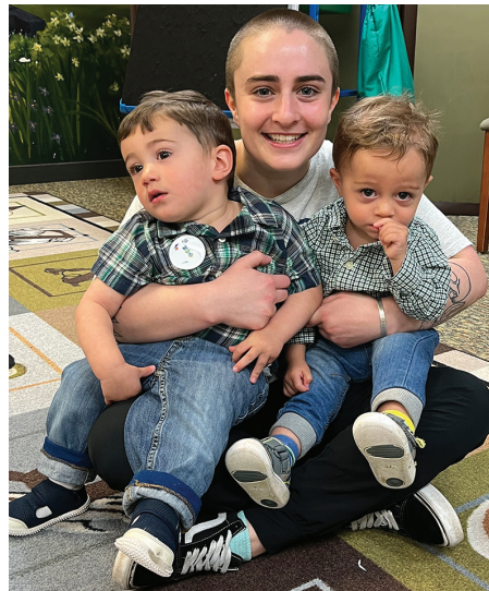
Double the fun for twins at Toddler Tales.